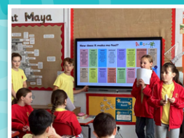
St Paul's Catholic Primary School

The news sheds light on experiences and perspectives, helping children to discover, relate to, and empathise with other people's stories.