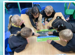
Allington Primary School

Conversations inspired by the news can support children to develop their communication skills, by sharing their own responses and listening to (and respecting) others' views on a topic.