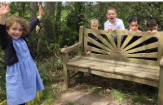
Atlantis: We went into our beautiful school grounds to retell the Ascension story through drama.