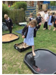
Discovery: Missing Number 20 RE-Special Places