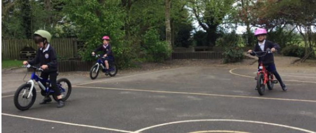
Tot and Tyres with pedals!