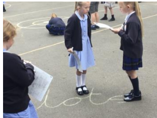
Endeavour: Pentecost – interpreting the event in art.