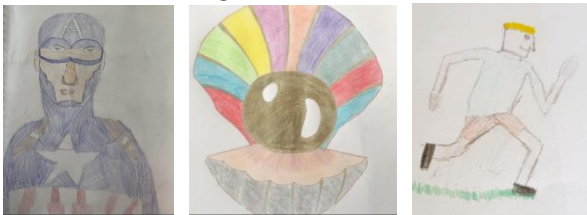
Y5/6- Mythical character and magical item design as well as studying how we move in athletic events ready to make sculptures.