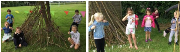
Year 1 Den building.