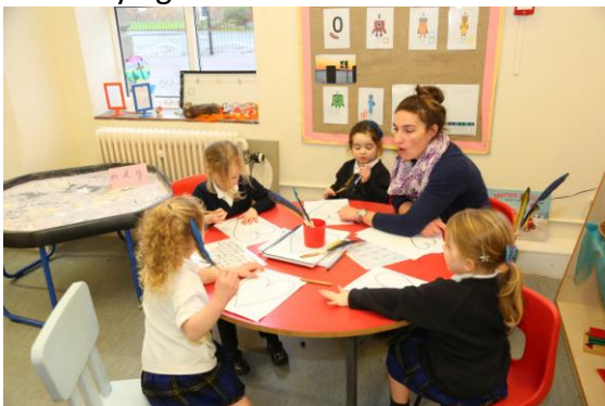
Sex and Relationship Education

Each November, our school takes part in anti-bullying week.