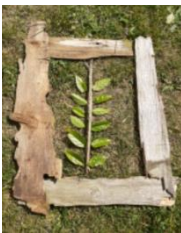
Enterprise children have been creating outdoor artwork.