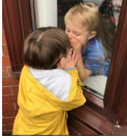
Social distance Hello.