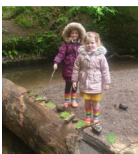
Nature repeating patterns-Summer and Neave