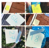
Ruby has been finding times Dentable answers in her garden